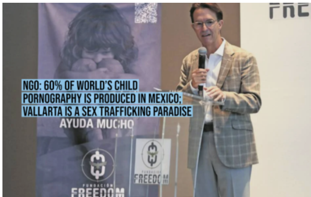
Figure 2: Child pornography industry in Mexico

An example of child pornography crimes can be taken from the book, “Los Demonios del Edén” (The Demons of Eden), by reporter Lydia Cacho. This Mexican reporter uncovered a child pornography ring in the hotel zone of Quintana Roo, Mexico in 2003, which sold the sexual services of minors. Countries such as Colombia, Japan, Thailand, and the USA were among the destinations for these minors. This hotel zone was in charge of promoting child pornography to consumers who were mostly important national figures, such as politicians and governors. After Lydia published the book, she suffered several attacks and threats between 2003 and 2007. Finally the leaders of the group were brought to justice.